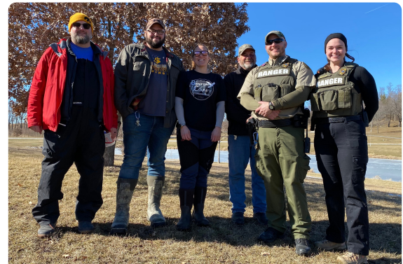
Staff at the Rodgers Park Ice Fishing Tournament February 2023