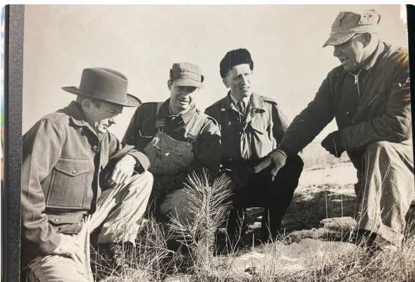
Tree planting in 1959 at Hannen Lake Park

The Benton County Conservation Board's (BCCB) duty is to serve the residents of Benton County. The BCCB consists of five county residents appointed by the Board of Supervisors.