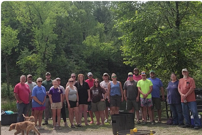
Most of the BCC staff at the summer 2023 outing