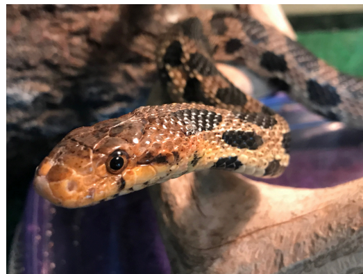
Figure 9: Cinnabar, our beloved Western fox snake

Cinnabar, the Western fox snake, came to us in 2012 after being found in Mahaska County Conservation's Nature Center. The naturalist who found the snake in her office thought her young fox snake escaped, and went to put it away, only to learn her fox snake was still safely secured in its enclosure. Cinnabar found her way from that naturalist's warm computer tower to the warmth of the Benton County Nature Center. She was our first Animal Ambassador, helping educate on the importance of snakes in our ecosystem. It is hard to express how much of an impact an Animal Ambassador has on the community, even more so with a snake like Cinnabar. For many, she may have been the first and only snake that they ever touched. She helped shake fears of a commonly misunderstood animal, and created joy from her calm disposition in those who she impacted. When not slithering through dried leaves in her enclosure, she could be found over the necks of people with long hair, in hoodie pockets and winding through belt loops.