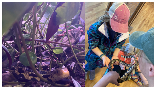
Figure 11 & 12: Cinnabar enjoying enrichment time in the aquaponics plants & youth touching her during a program