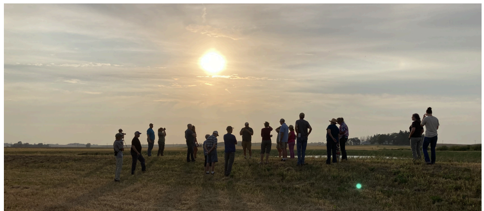
Figure 4: Naturalist led hike at the Edna Shain Fen Grand Opening in 2022

While 70 years is an important milestone, it's also a starting point for what comes next. Future plans include expanding recreation opportunities, continuing habitat restoration efforts, and strengthening community connections through education and events. As we celebrate 70 years, we want to thank everyone who has been part of this journey, past and present. Your support has helped shape what