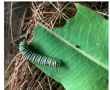
Figure 15: 5th instar monarch caterpillar munching away at a milkweed leaf

Stop in the nature center this summer and observe the monarch life cycle in progress. We hope to be rearing monarchs through fall. The Benton County Nature Center is open on Mondays from 12:00pm-4:00pm or call us at 319-472-4942 to set up a visit Monday-Friday, 8:30am-4:00pm.