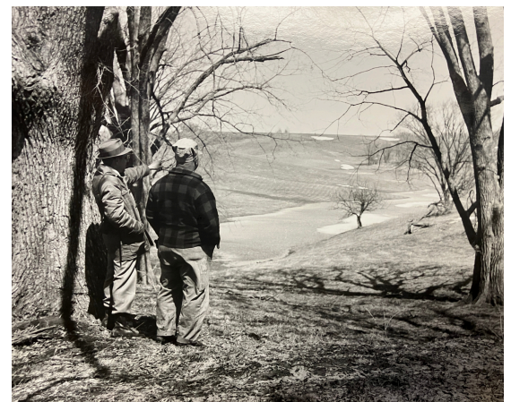
Figure 2: Two men looking at newly constructed Hannen Lake

The cornerstone of county conservation was built on a simple idea: take care of the land and make it accessible for people to enjoy. From the first acres of protected land to the development of parks and wildlife areas, each step forward was made possible by community support, dedicated staff, and a shared belief in the value of conservation. Over time, those efforts grew, adding more parks, more programming, and more ways for the public to connect with the outdoors.