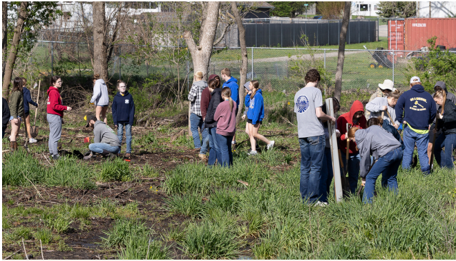
Figure 3: High schoolers helping plant trees at Atkins Roundhouse

From a single campground to six, from developing and managing one mile of trail to 40 miles, from a few public hunting acres to over a thousand, the individuals who started Benton County Conservation in the 1950s and brought us to where we are today have made SUCH an impact. They set the stage for us moving forward and we cannot thank them and you enough for allowing us to continue. Now, we are continuing that hard work with restoration projects, facility improvements, accessibility, outreach, and so much more.