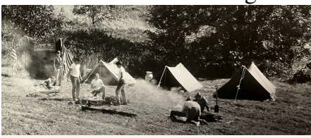
Figure 7: Scout camp at Hannen Lake Park in the 60's

It is often said "it takes a village," which can be said of any kind of work or organization. . . I am sure the local leaders in our scouting programs have said those exact words. But, what I hope they know and remember at the end of the day, is that we see them as part of our conservation village, too. Because it does take a lot to keep all aspects of a park functioning moving forward; especially for 70 years! It often takes the derived meaning of a Scout's Oath to get the job done: