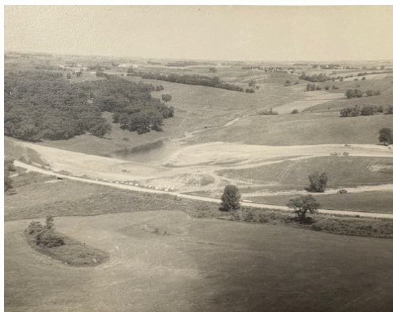
Figure 1: Aerial view of Hannen Lake during construction

Benton County Conservation Board was voted into action as one of the first 16 conservation boards created in Iowa. Following the development of the Benton County Conservation Board, the community got to work. Hannen Lake Park was created as the first man-made lake in Iowa for county conservation boards in 1958! Construction of the lake called for moving over 56,000 cubic yards of earth, placing 1,350 tons of stone rip rap, and constructing a 600 foot long dam to create a 45 acre lake, with a bill for dirtwork around $18,000! Check out some of the pictures.