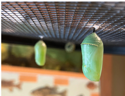
Figure 14: Freshly formed chrysalis at the nature center

Stop in the nature center this summer and observe the monarch life cycle in progress. We hope to be rearing monarchs through fall. The Benton County Nature Center is open on Mondays from 12:00pm-4:00pm or call us at 319-472-4942 to set up a visit Monday-Friday, 8:30am-4:00pm.