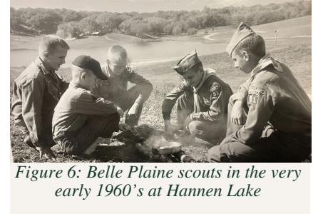
Figure 6: Belle Plaine scouts in the very early 1960's at Hannen Lake

in the 1960's and 70's, adding "with the scouts alone, we planted a lot of trees out there every year, probably at least 100 trees." A recent article we found in the archives said the conservation board had help planting over 15,000 red, white and scotch pines in the early days. Paul continued reminiscing, "my fondest remembrance was the monkey bridge that the Boy Scouts built somewhere in the sixties or early seventies. We put in bird houses and such. . . a lot of great memories there." Today, many of those trees are the mature forests that surround the park.