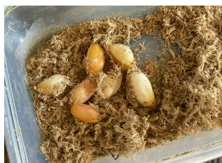
Figure 10: 7 eggs laid by Cinnabar in 2023

Cinnabar was named after the clever fox who taunts George Washington and his hunting hounds in the children's book Cinnabar, The One O'Clock Fox by Marguerite Henry. When she arrived at our Nature Center, she was only 15 inches long. By the time we said goodbye, she was nearly 53 inches. Cinnabar had 3 "Mickey Mouse" spots on her body, a common feature on fox snakes. She was mentioned on the radio show Those Girls in The Afternoon on 102.9 for being a crowd favorite after the Vinton-Shellsburg High School Career Fair, although they called her a "garden snake." In all the years that Cinnabar was an Animal Ambassador with us, she never pooped during a presentation which is a BIG deal when you are working with live animals.